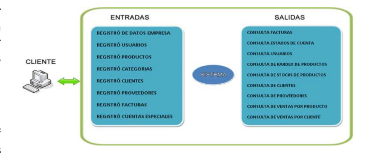
Figure 1. Schematic of system processes