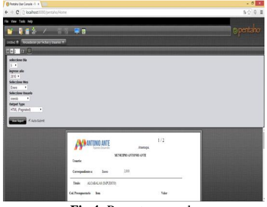
Fig 4: Reports example

Below you can watch, like example, one of the reports that they have been implemented with this thesis project.