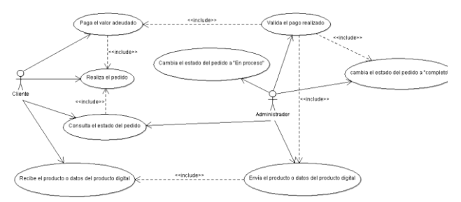
Figure 4. Use case sales and order management

The phase of delivery allows to know iterations to develop user stories.