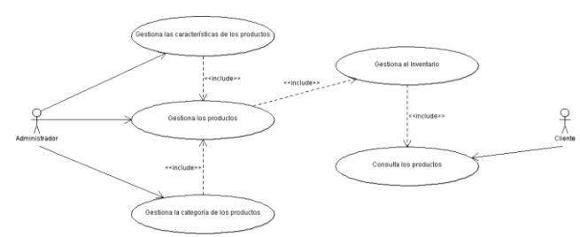
Figure 3. Catalogue and inventory management use case

The main deliverables have the module catalogue and inventory (products) and sales process management and order management.