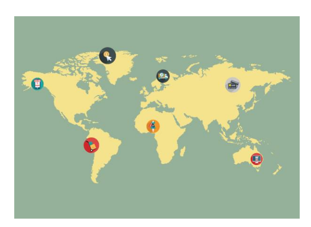
Figure 2. E-commerce around the world