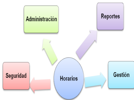
Figure 2: System Modules