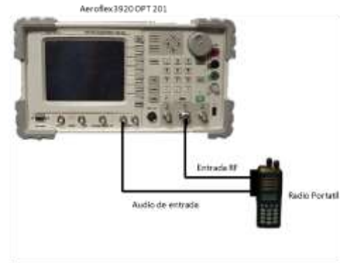
Figure 2. Conexión de the Aeroflex 3920 OPT 201

intensity was run at frequencies that police work currently using the spectrum analyzer was developed Aeroflex 3920 OPT 201, allowing you to specify the locations of the province to the northwest, northeast, southeast and southwest that have no network coverage.