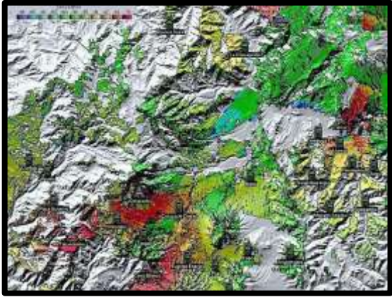
Figure 4. Coverage of trunking system in Imbabura