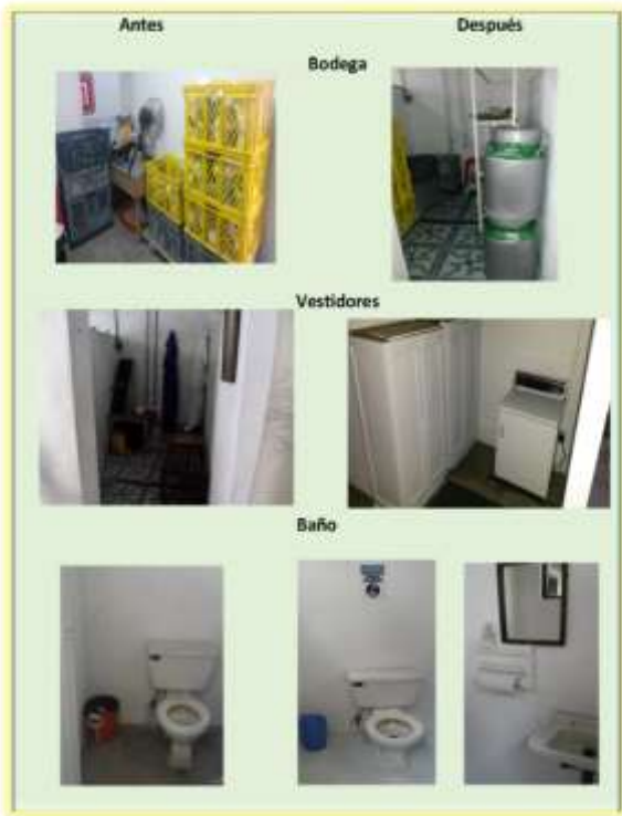
Figure 3. Adequacies of infrastructure in complementary areas in Uniqueso

Was the lifting of the processes (POE AND POES), with the standard-setting adjusted to standards and registries that allow record the activities carried out in each stage of the production process.