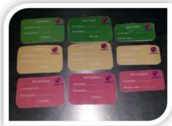
Figure 5. Quality Control in Uniqueso

There were continuous training for the staff of the company on Good Manufacturing Practices.