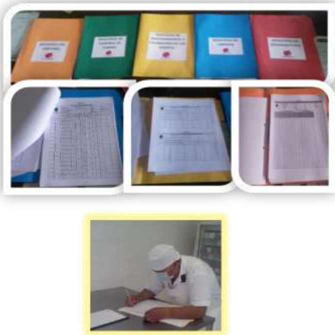
Figure 4. Lifting of processes in Uniqueso

Was the lifting of the processes (POE AND POES), with the standard-setting adjusted to standards and registries that allow record the activities carried out in each stage of the production process.