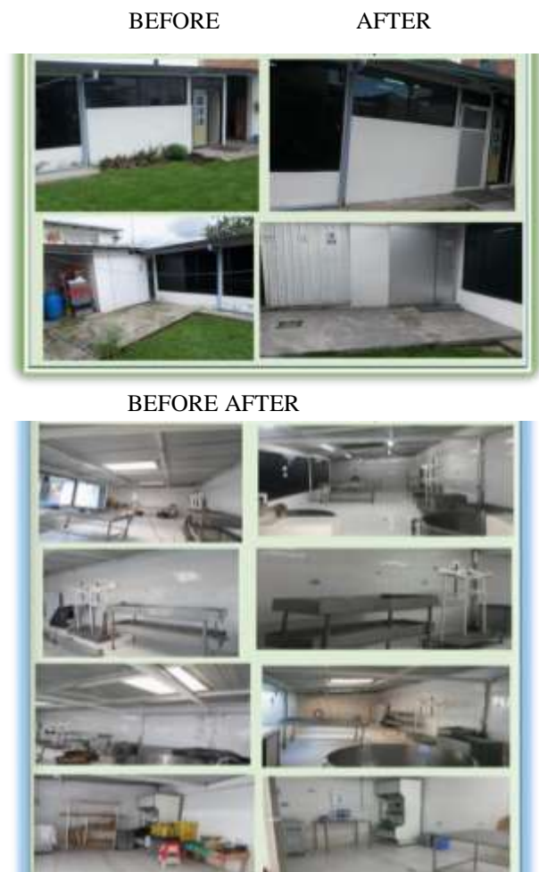
Figure. 2. Adequacies of infrastructure in Uniqueso

Uniqueso made adaptations of floors, walls, ceilings, windows and pest control, in regard to infrastructure, both on the outside and in the interior of the production facility: