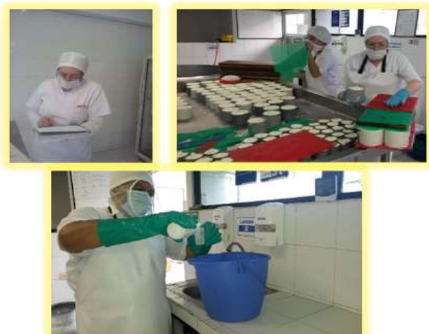
Figure 6. Trainings in Uniqueso

There were continuous training for the staff of the company on Good Manufacturing Practices.