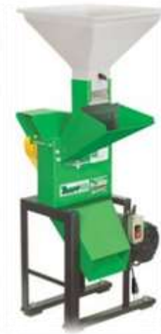
Fig 1. Grinding mill TRAPP TRF 300

The maximum output of the machine is about 1000 kg / h under operating manual.