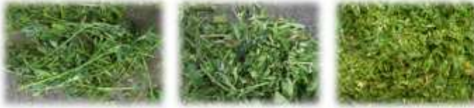
Fig 13. Results crushed into large, medium and small respectively