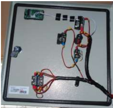
Fig 9. Locations buttons and selector switch