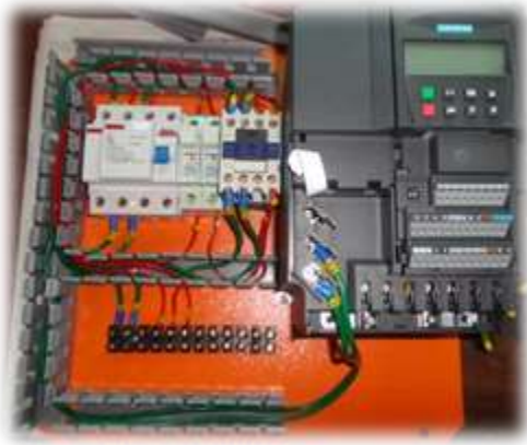
Fig 8. Wiring the electronic board