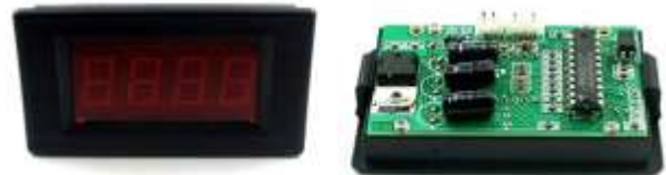
Fig 3. Digital tachometer

Tachometers usually measure the revolutions per minute (or, according to its acronym, RPM). Originally, tachometers were measured mechanical and centrifugal force. Currently most tachometers are digital and they are much more accurate.