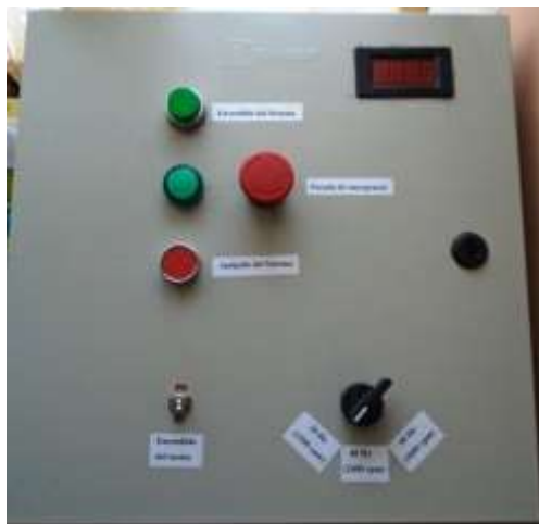
Fig 10. Mounting System Total