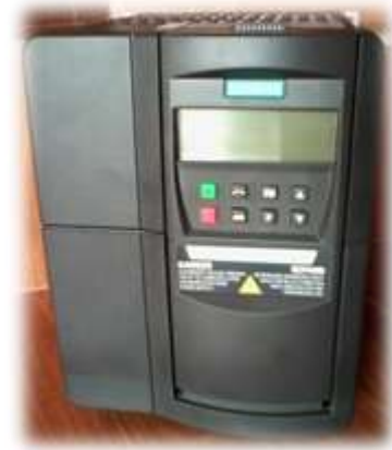
Fig 2. Drive Frequency

The MICROMASTER 440 with its default settings made at the factory, is ideal for a wide range of simple motor control applications. It can be used both in applications where it is isolated as integrated automation systems.