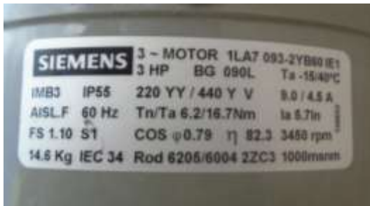
Fig 4. Plate machine motor

According to data from the following table in motor crusher which represents the characteristics of a three phase motor 3 Hp have: