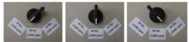
Fig 12. Positions for the 3 fixed frequencies.

After having installed and made the respective connections of the components, we proceed to perform the respective tests to verify the operation of the control system. The tests are done proceed to the 3 variations of speed that the inverter permits in their 3-pin digital inputs that are programmed for 3 different size crushed. Speed variations are activated by a 3-position selector.