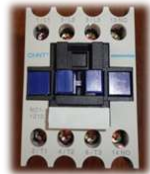
Fig 7. Contactor NC1-12

The contactor is an electro-mechanical control device, which acts like a switch, and can be remote-controlled via the electromagnet is fitted.