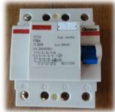
Fig 6. Differential Switch

Differential amperometric circuit breaker is a protective device that is disconnected when the system leaks a significant current to earth.