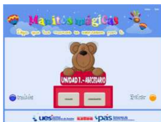
Fig. 4. Display access to content