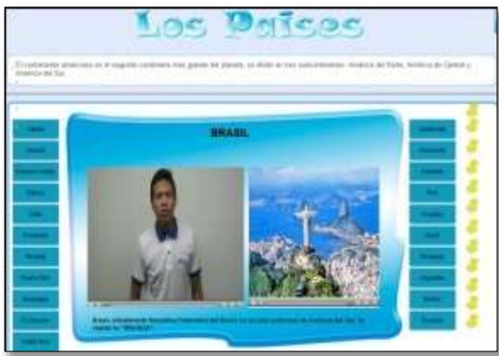
Fig. 7. Display content