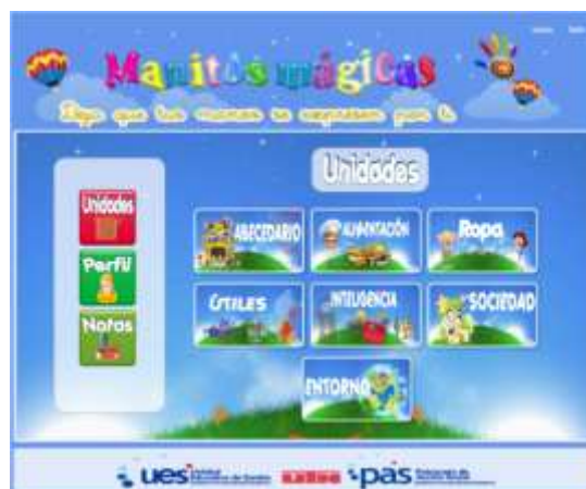
Fig. 3. Main Menu Basic Module

The "Manitos Magicas" web application is a support tool, consists of two modules: basic and advanced module. The basic module has seven units: ABC, Food, Clothing (Clothing), Useful, Intelligence, Society, and Environment. Here are some pictures of your interface