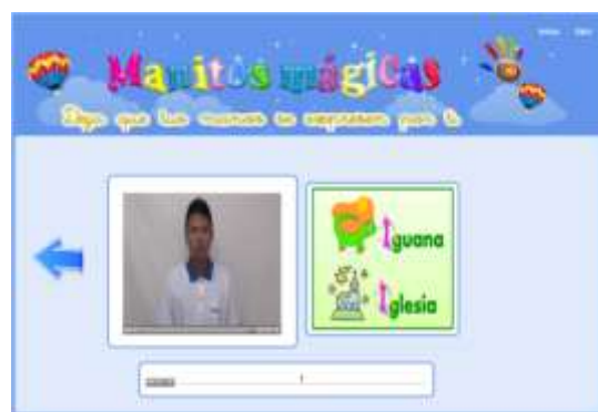
Fig. 5. Submission of topics

The advanced module has five units: Geography (countries, provinces of Ecuador, maps), math (addition, subtraction, multiplication,) vocabulary, Language and Communication (verbs, nouns, antonyms, synonyms, etc.) and natural sciences, further make sentences using those words, everyday phrases to start a conversation a seeker and games. Here are some pictures of its interface.