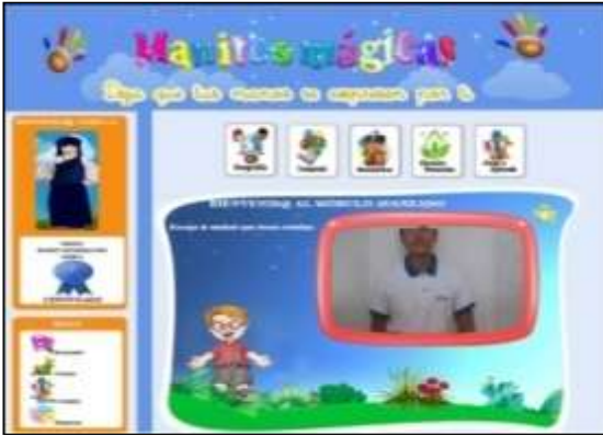
Fig. 6. Main Screen Advanced Module