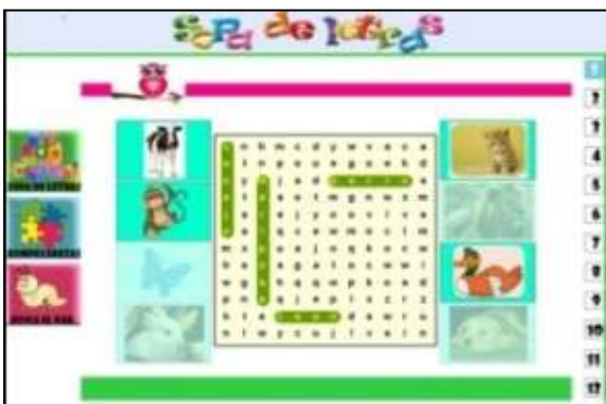
Fig. 8. Screen playful activities