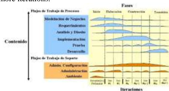
Figure 1. RUP Phases.

RUP uses a four-step system, each consisting of one or more iterations.