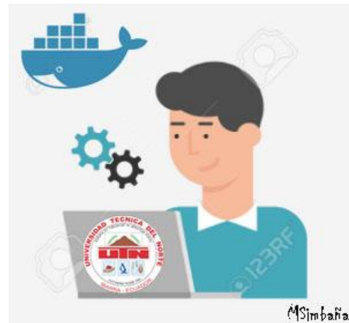
Figure 2. Running the Docker tool.

After mentioning the characteristics of the tool a practical case was also made to demonstrate that the tool works and that it also provides the advantages mentioned above.