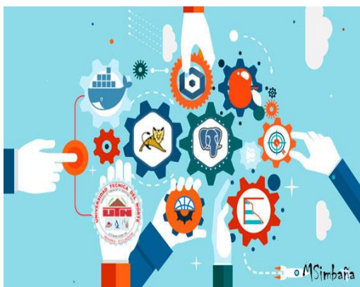
Figure 1. virtual infrastructures with Docker.

tend to have is the use of the docker tool because it gives the user the ability to manage a diversity of virtual infrastructures and also to optimize the flow of hosted applications.