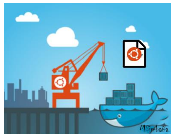
Figure 4.Docker Installations on Ubuntu.

It is worth mentioning that this virtual testing infrastructure was installed using the Linux version of Ubuntu 14.04(x64).