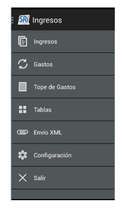
Figure. 2. Movile Application Main Menu

Once authenticated, the home screen of user interface (UI) for the mobile application shows the following: