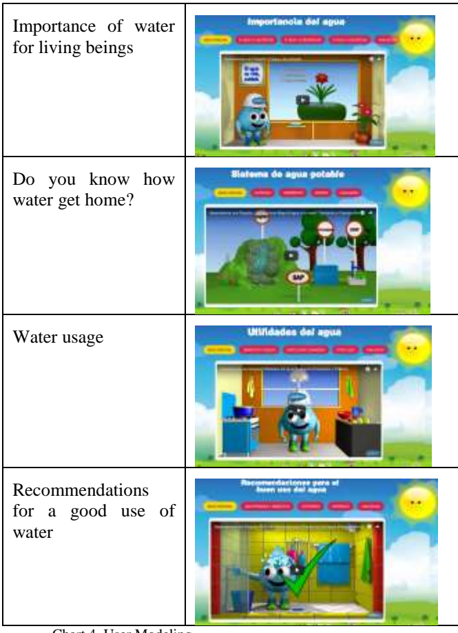
Chart 4. User Modeling.