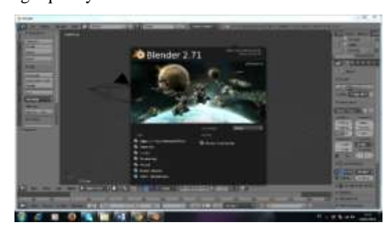
Figure 1 . Blender Window.

For the project development a great variety of free software tools were that helped create each of the elements of the application, including the most important, Blender. It is an open source software dedicated to modeling animation and three-dimensional graphics both still images and high quality videos.