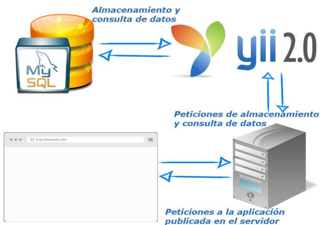
Figure 5 Web System Content Management Architecture