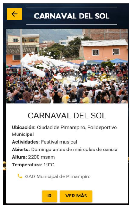
Figure 3 Tourist Place Detail

This information will be presented to the end user of the mobile application in the following format