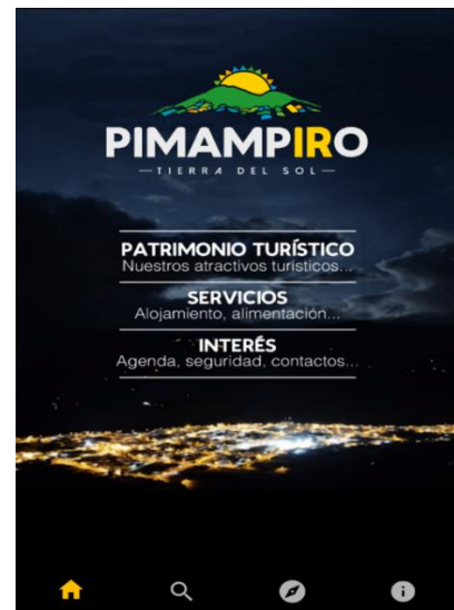
Figure 1 Main Menu Pimampiro Destination

The menu should be created in descending way in the side menu in the Tourist attractions option you must create the main menu itself that we can see in the following image