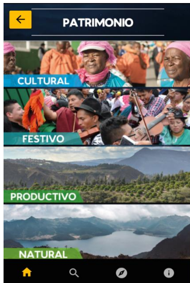
Figure 2 Category of tourist places

Tourist places: This option of the Content Manager will allow to create the tourist sites, in this we must enter coordinates (routes), web site, telephones, etc.