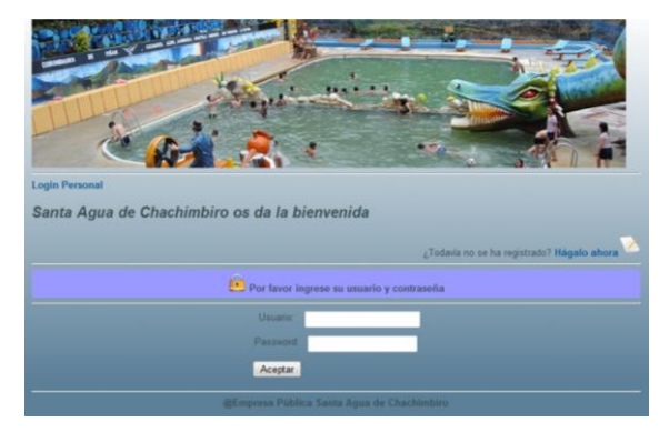
Figure. 4. User Interface: Project Login 5

For the service of on-line payments considering the use of PayPal to be the system most widely used online payment market.