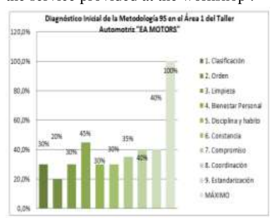
Figure 1: Bar chart - Initial Diagnosis Methodology 9S in Area 1 Taller Automotriz "EA MOTORS"

As we can see in Area 1 that comprise (office, warehouse and dressing) get a 33 % compliance level of 9S. We can also analyze what concerns the fourth S we have a 45 % compliance, we will work with the other S, especially the second S that is order, and we got a 20% compliance with this power ensure the service provided at the workshop.