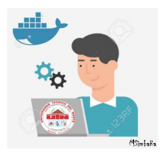
Figure 2. Running the Docker tool.

After mentioning the characteristics of the tool a practical case was also made to demonstrate that the tool works and that it also provides the advantages mentioned above.