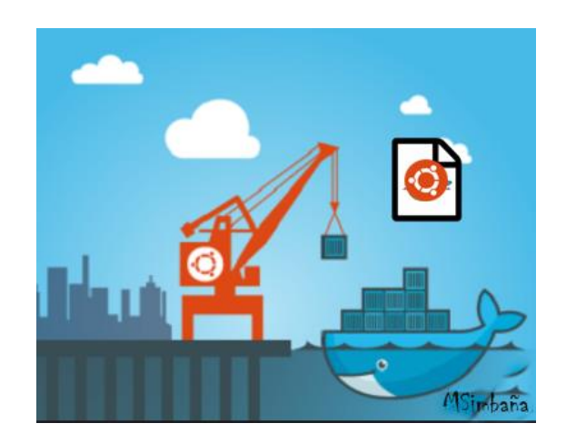
Figure 4. Docker Installations on Ubuntu.

It is worth mentioning that this virtual testing infrastructure was installed using the Linux version of Ubuntu 14.04(x64).