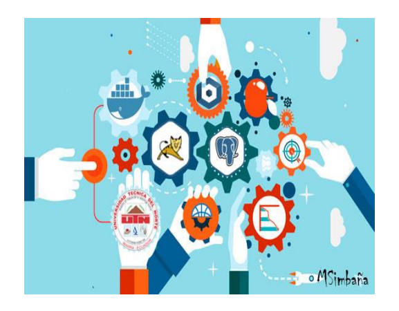
Figure 1. virtual infrastructures with Docker.

tend to have is the use of the docker tool because it gives the user the ability to manage a diversity of virtual infrastructures and also to optimize the flow of hosted applications.