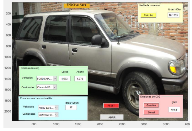
Figure 3. Ford Explorer vehicle fuel consumption.