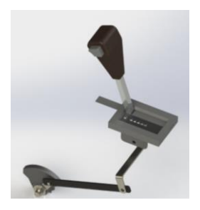
Figure 2. Adaptation of the selector lever.

It was adapted to adapt the lever and check its operation of the different gears of the vehicle by measuring angles of the new mechanism checking the maneuverability and comfort in driving.