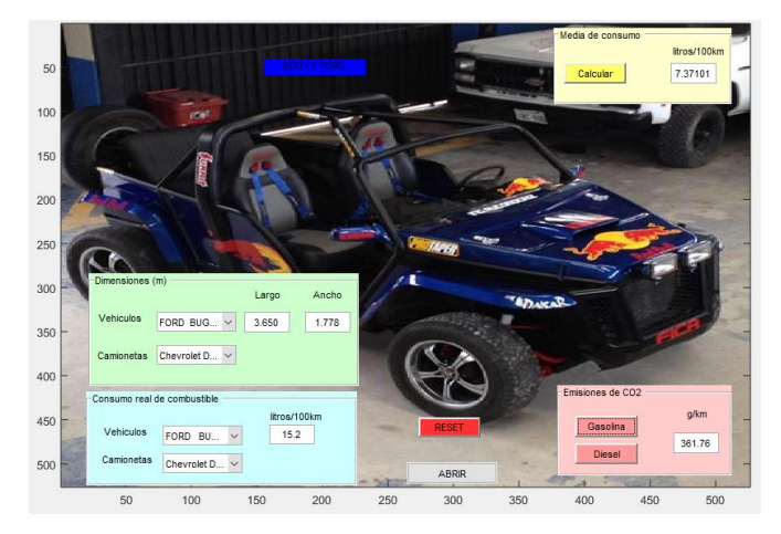
Figure 4. Urban fuel consumption Ford Buggy.

With the adaptation of the V6 electronic injection engine of a Ford Explorer vehicle, automatic gearbox with torque converter 5R55E and modifications and adaptations of the components that work in conjunction with the engine, in addition to the modifications of the body in its weight, long and Width was obtained the reduction of the average fuel consumption of 10,127 liters to 7,368 liters and the reduction of CO2 emissions of 22.85% per 100 km traveled.