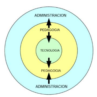
Graphic 1: Stages of Development E-Learning

The method called star of knowledge, find a clear link between training and use of technology. It also takes into account the management training and the possibility of publishing content technology, the relationship is latent in each of its levels. Current pedagogical models greatly leverage the use of technology to generate quality information and the administrative side agrees to comply with guidelines concerning the development of e-learning method.